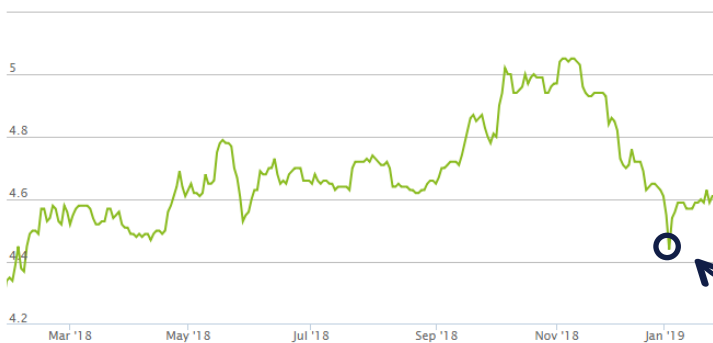
SERIES: Average 30 Yr. Fixed Mortgage Rates